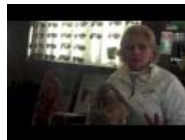
Shades Of The Bay