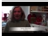
Tara's Gifts & Parties of Distinction