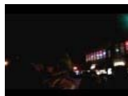
Grand Illumination Annapolis Christmas Tree